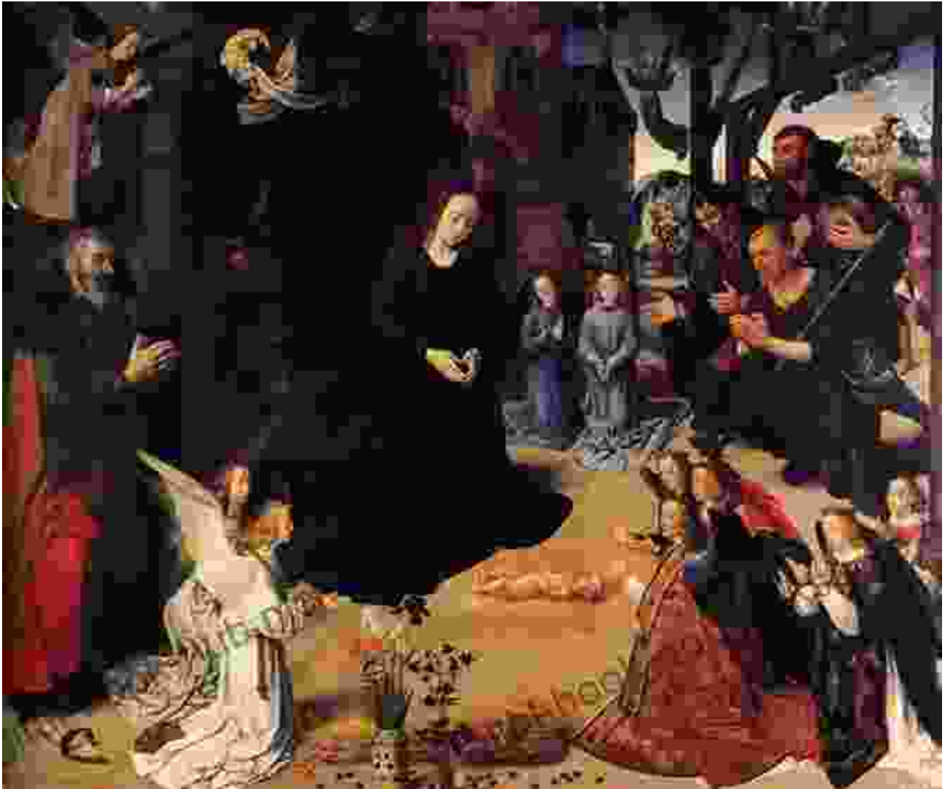
The Portinari Altarpiece, another masterpiece by the Master of the Mysteries (c. 1475)

While the Master of the Mysteries' oeuvre is relatively small, their impact on the art world is profound. The Ghent Altarpiece, considered one of the greatest works of Western art, has influenced generations of artists and art historians. The Portinari Altarpiece, another of their major works, is renowned for its exquisite craftsmanship and intricate symbolism.