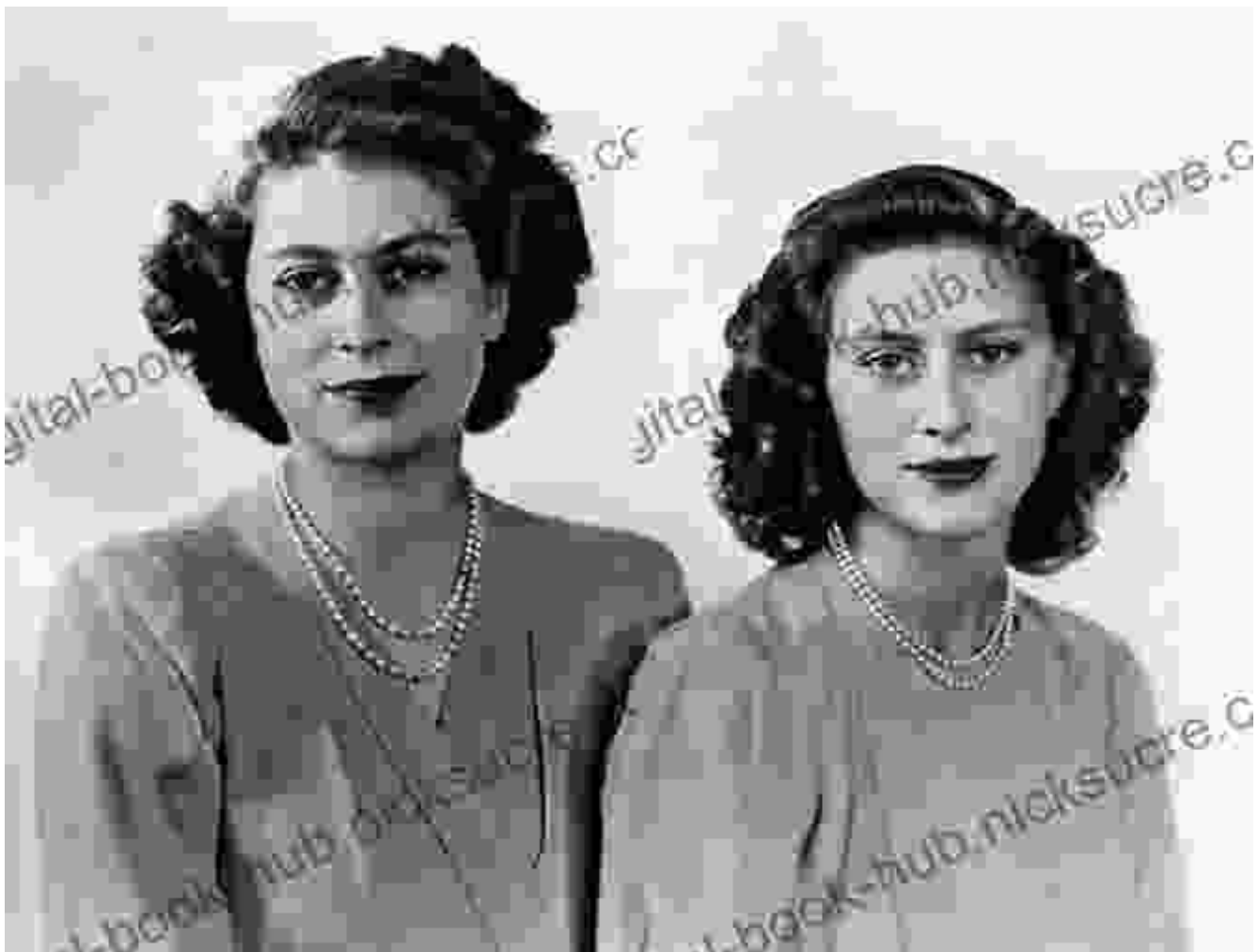
The Princess of Wales

Margaret ultimately decided to break off her relationship with Townsend. However, she never married and remained single for the rest of her life. The story of Margaret's tragic love affair became a symbol of the restrictions and sacrifices that members of the royal family must endure for the sake of duty.