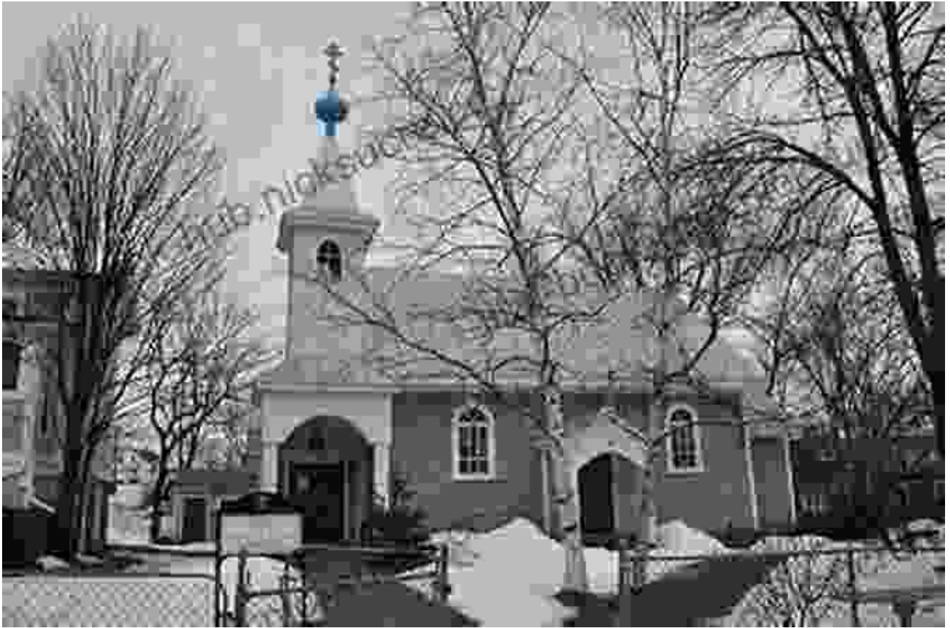
The Russian Orthodox Church in Richmond, Maine, in the early 1900s.