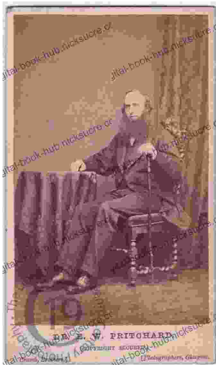
The Man Who was Hanged by a Thread: and Other Tales from BC's First Lawmen (Amazing Stories)