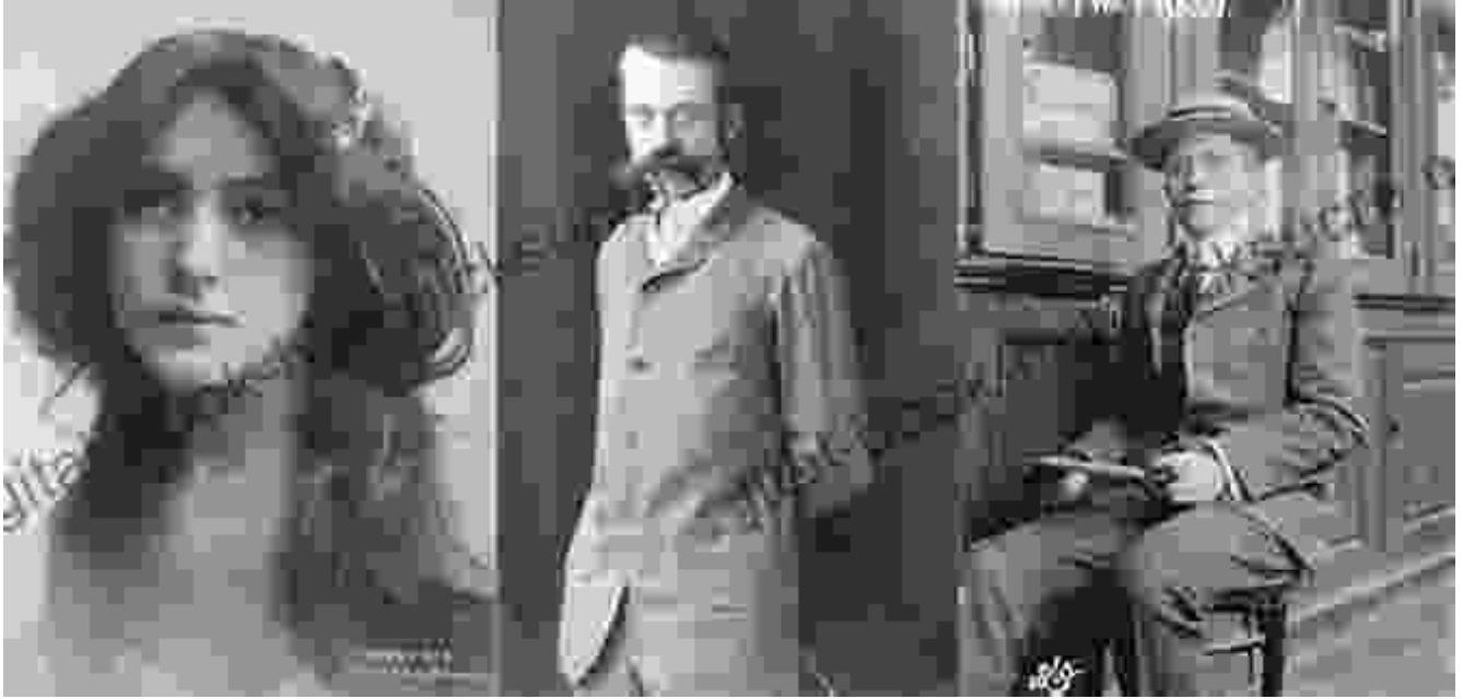
Evelyn Nesbit and Harry K. Thaw on their wedding day in 1905