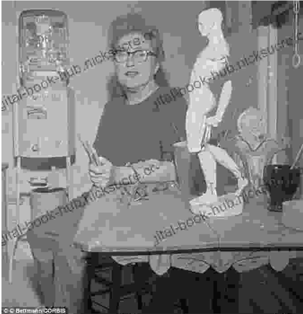
Evelyn Nesbit in her later years