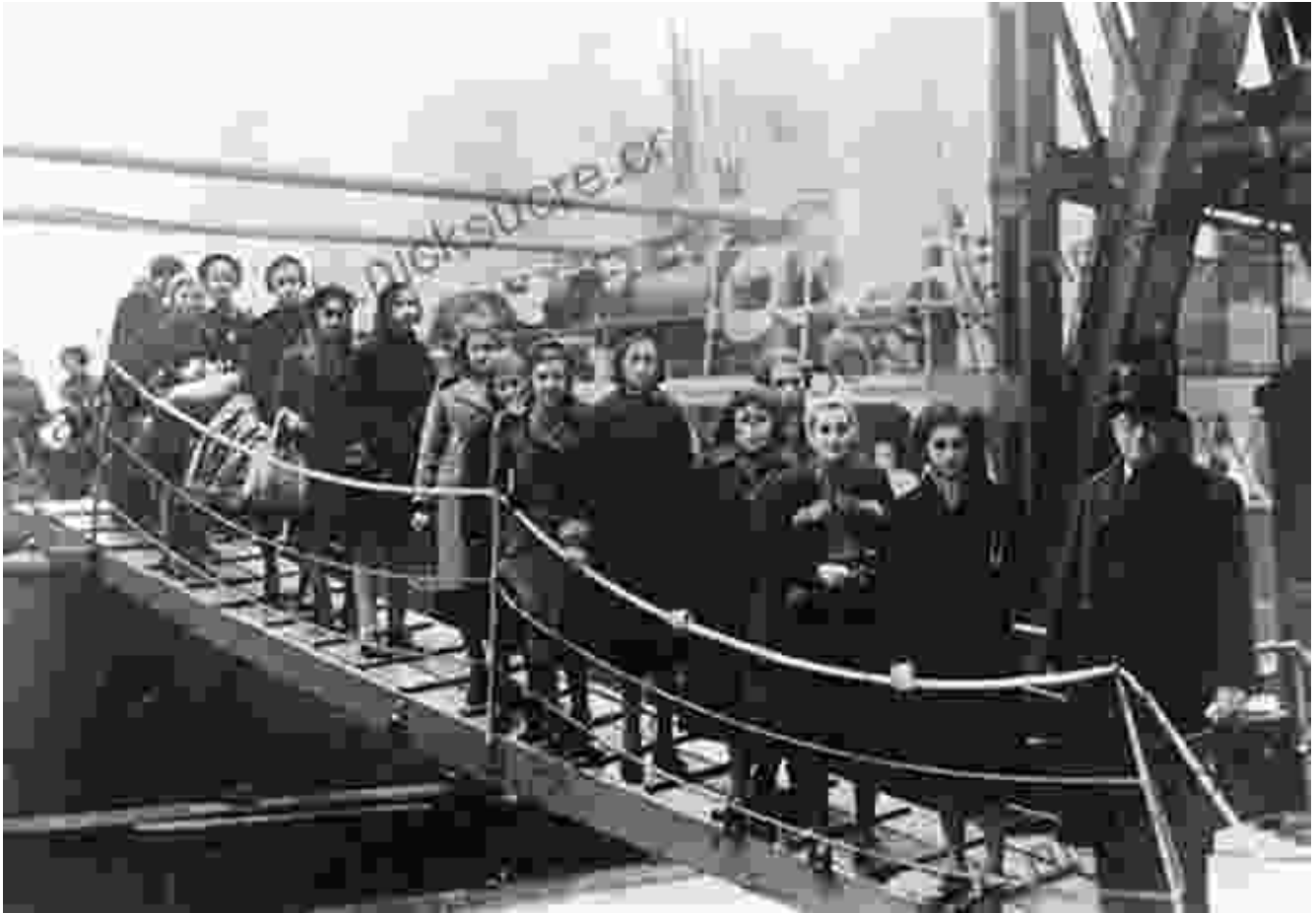
A Jewish family arrives at a London port, circa 1900.