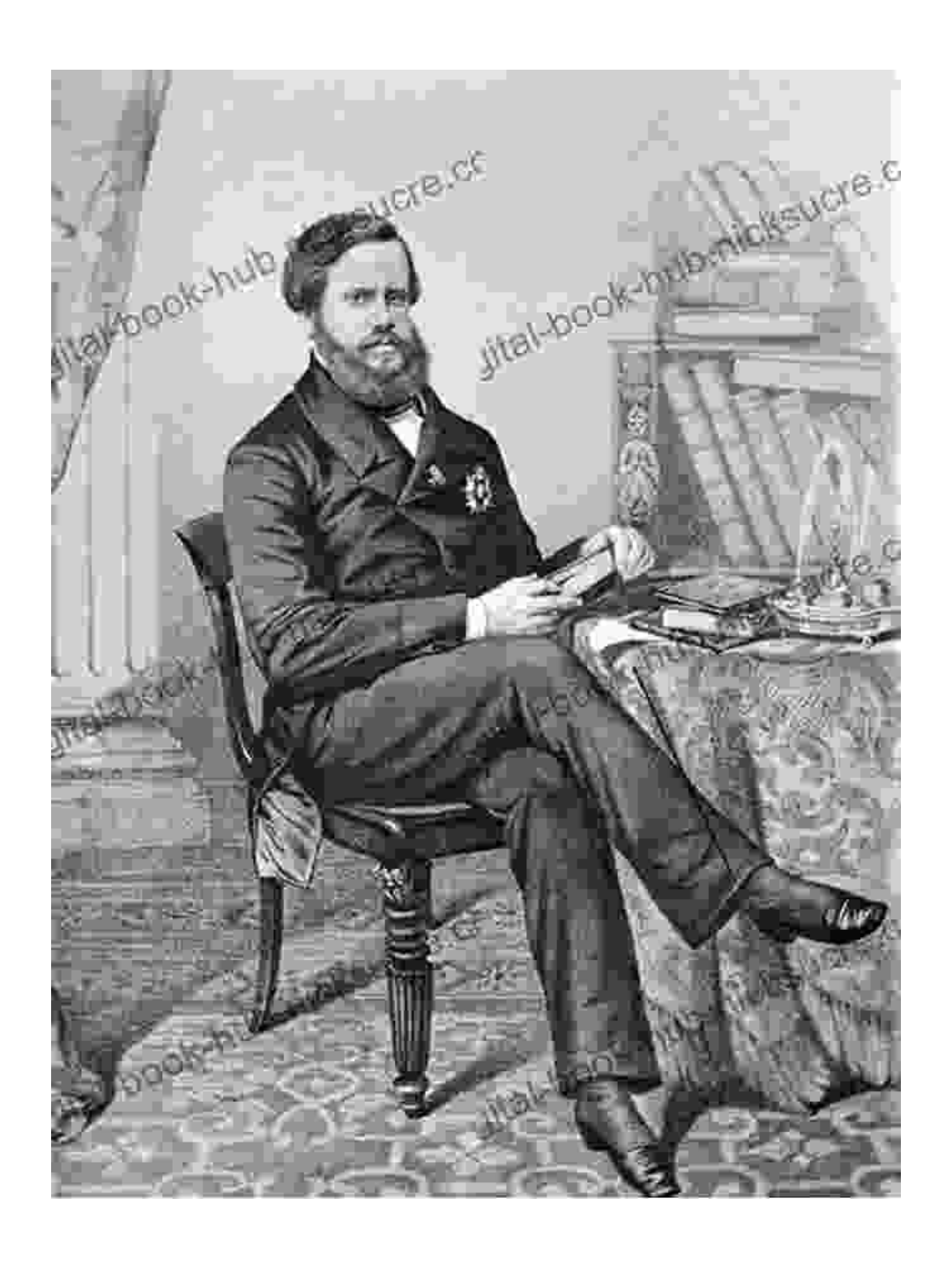
Dom Pedro II's legacy continues to inspire Brazilians today

The legacy of Dom Pedro II extends far beyond his lifetime. He is widely regarded as the greatest figure in Brazilian history, a towering intellect who guided the nation through a period of unprecedented transformation.