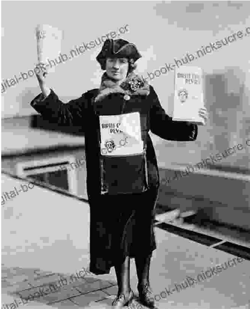
Kitty Marion speaking at a rally