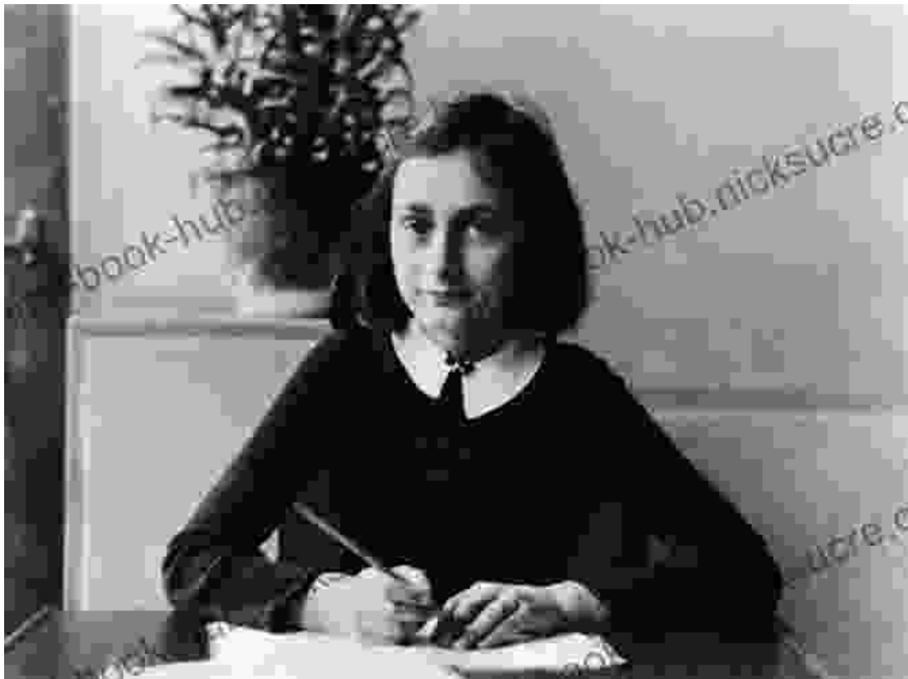
Anne Frank, circa 1941.