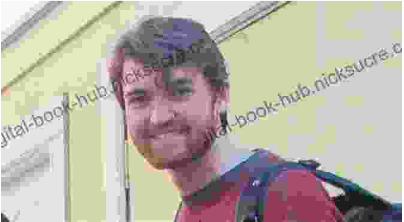
Ross Ulbricht, the founder of the Silk Road

Ulbricht, who went by the online alias “Dread Pirate Roberts,” was a brilliant and elusive figure. He took great pains to conceal his identity and location.