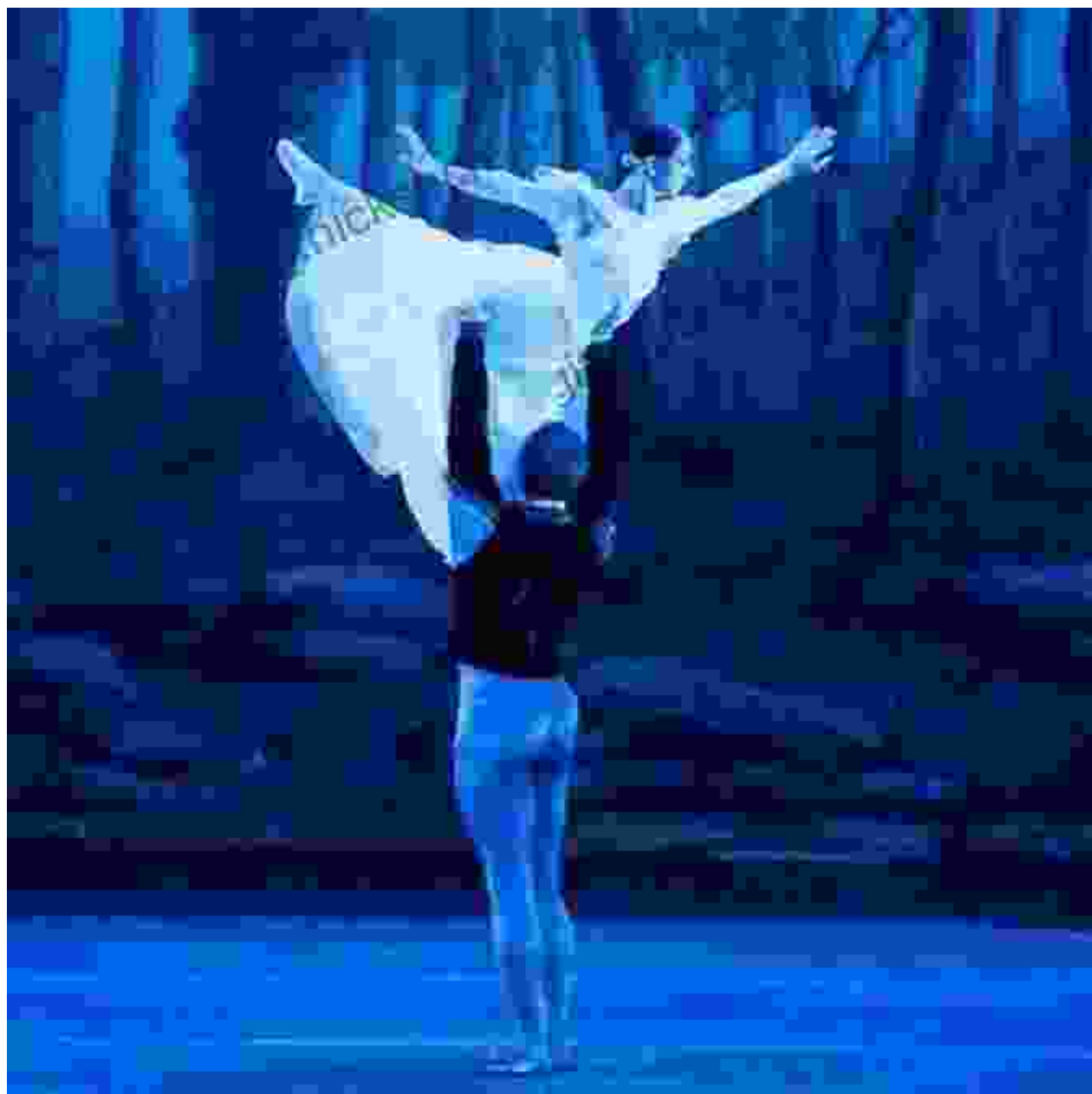
Olga Pavlova in costume for Giselle