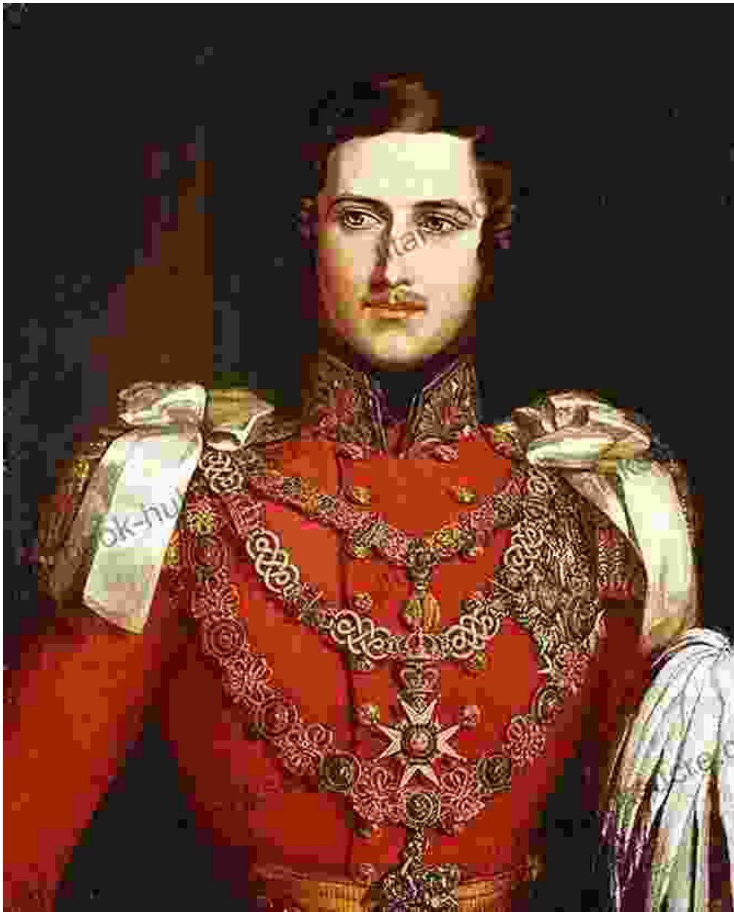
Prince Albert of Saxe-Coburg and Gotha, aged 20, circa 1840.

Albert was born on August 26, 1819, to Ernest I, Duke of Saxe-Coburg and Gotha, and Princess Louise of Saxe-Gotha-Altenburg. He was the second son of his parents and had two older sisters.