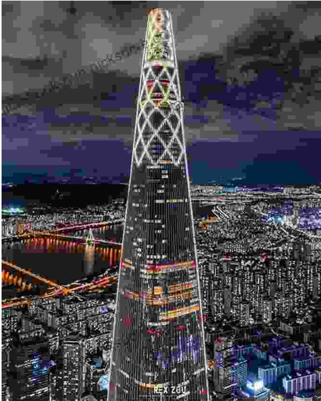
Lotte World Tower, the tallest building in South Korea