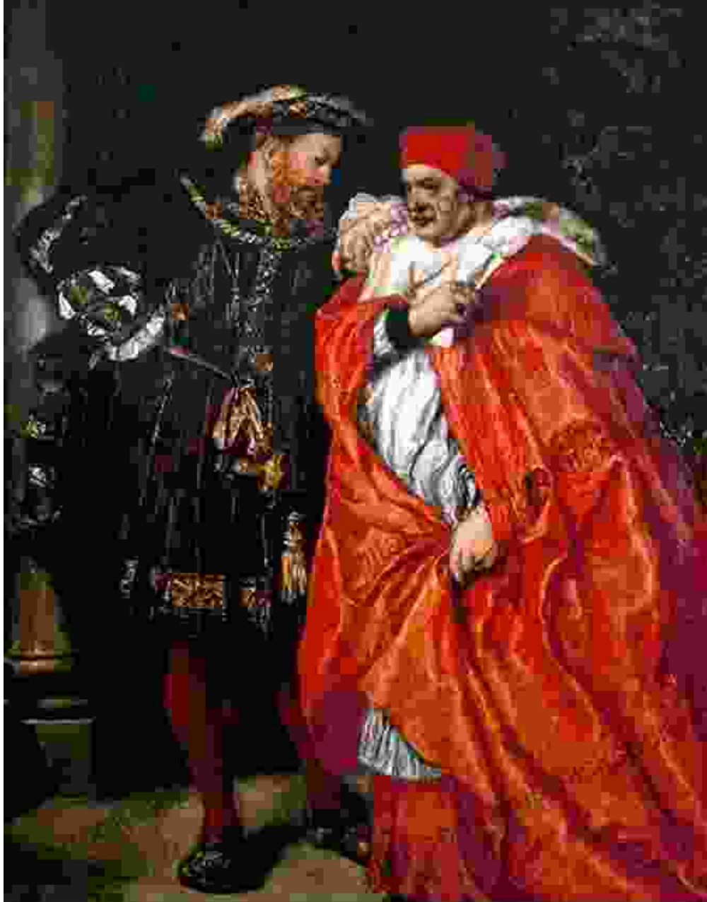
Cardinal Thomas Wolsey

Cardinal Thomas Wolsey was another powerful figure in Henry VIII's court. He served as the king's Lord Chancellor from 1515 to 1529, and was responsible for overseeing many of the day-to-day affairs of the kingdom.