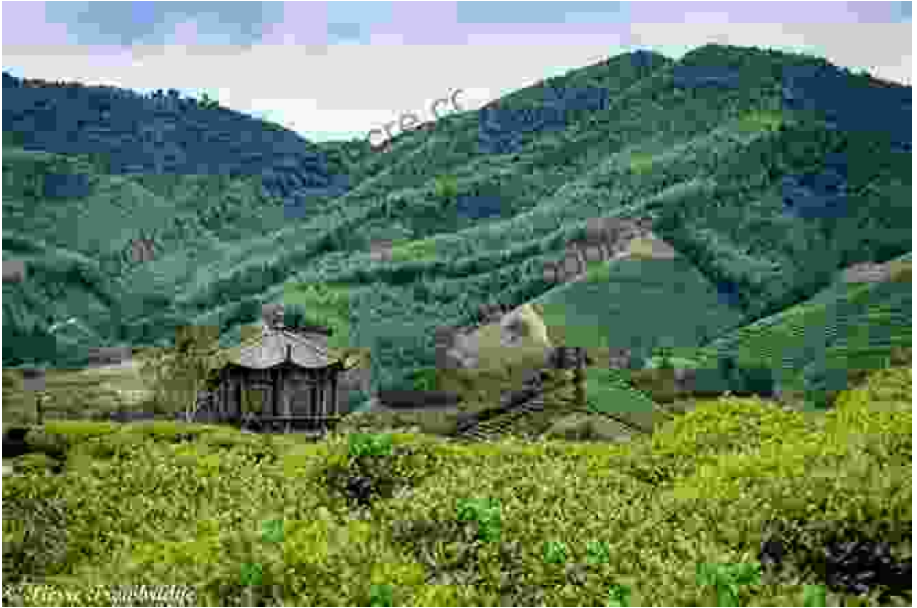
A Swire tea plantation in China