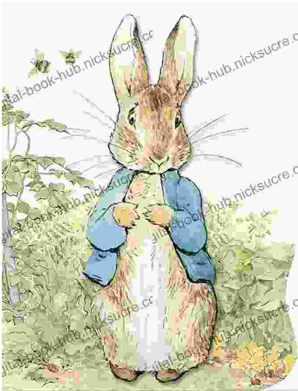
A Beatrix Potter Illustration

Beatrix Potter's love for gardening and her passion for nature permeated all aspects of her life and work. Through her horticultural pursuits at Hill Top Farm and her enchanting children's books, she left an enduring legacy that continues to inspire and enchant generations of nature enthusiasts. As a dedicated gardener, conservationist, and beloved author, Beatrix Potter