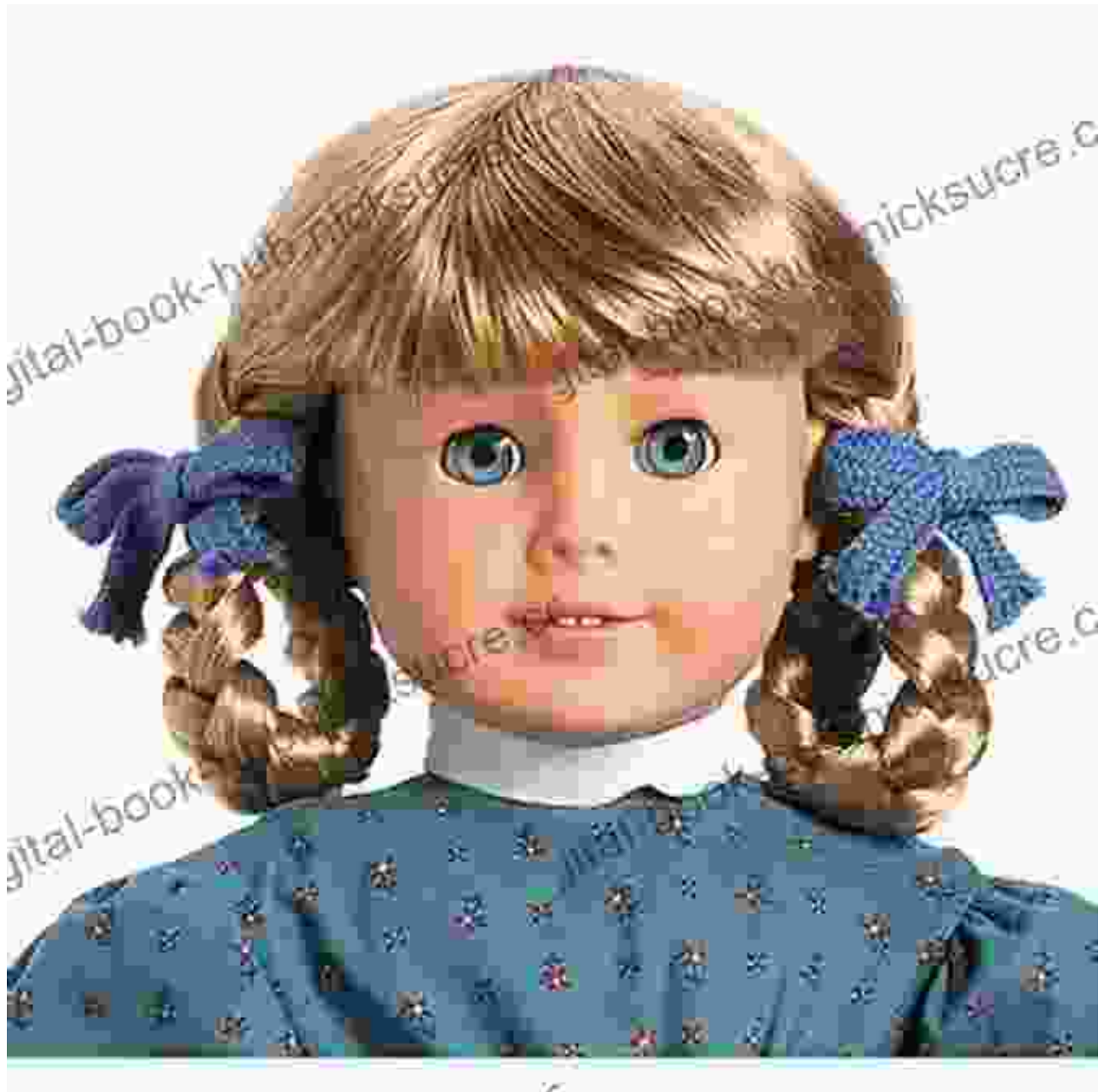
Kirsten Larson, an American Girl doll representing the Swedish Lutheran faith on the Minnesota frontier.