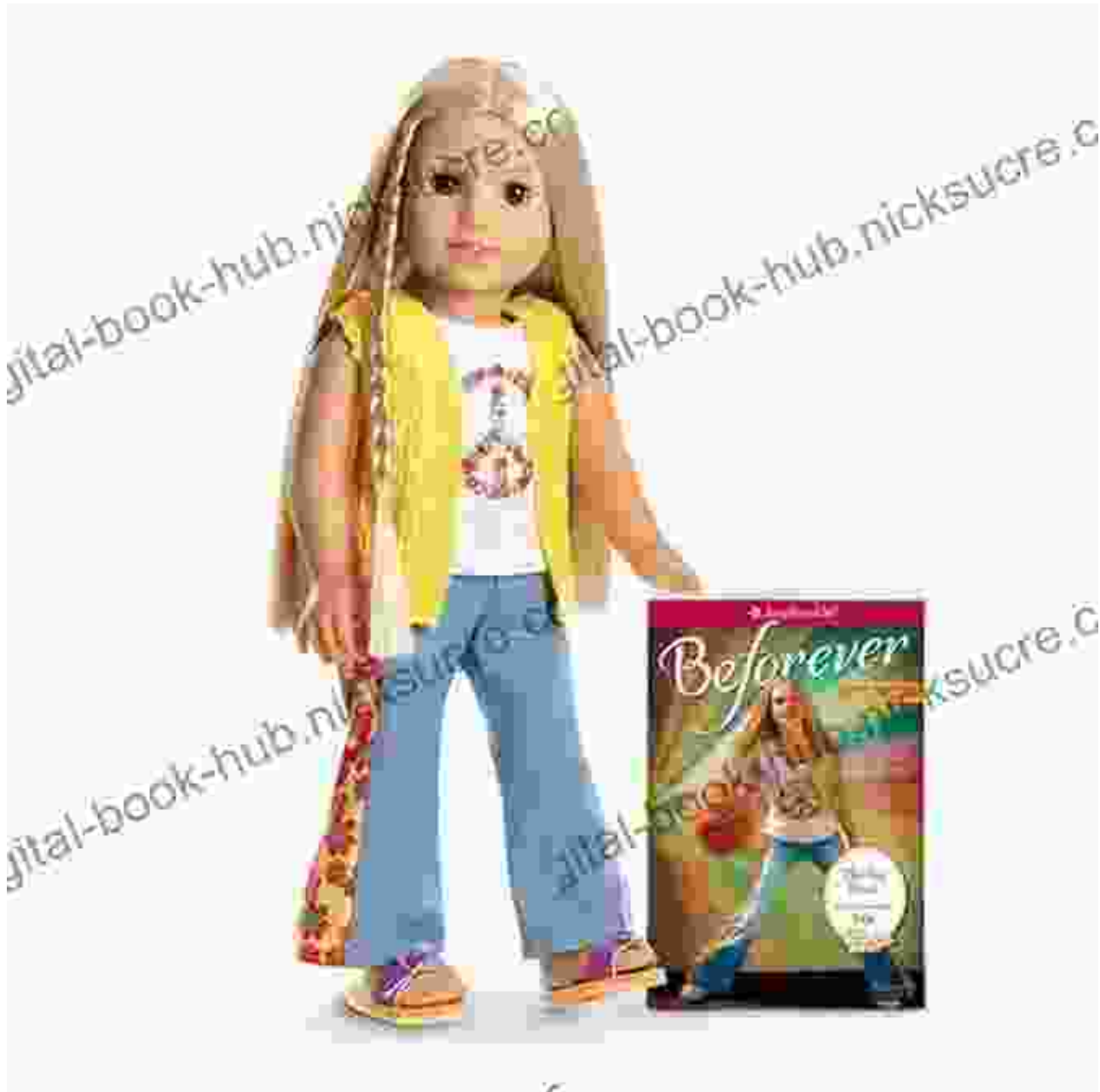
Julie Albright, an American Girl doll representing the religious experiences of girls in suburban America during the 1970s.